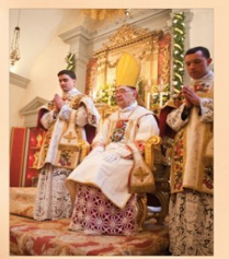
INSTITUT DU CHRIST ROI SOVERAIN PRÊTRE

Buy CD directly on website : www,domeofhome.org